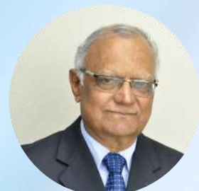
Hon. Suresh Desai