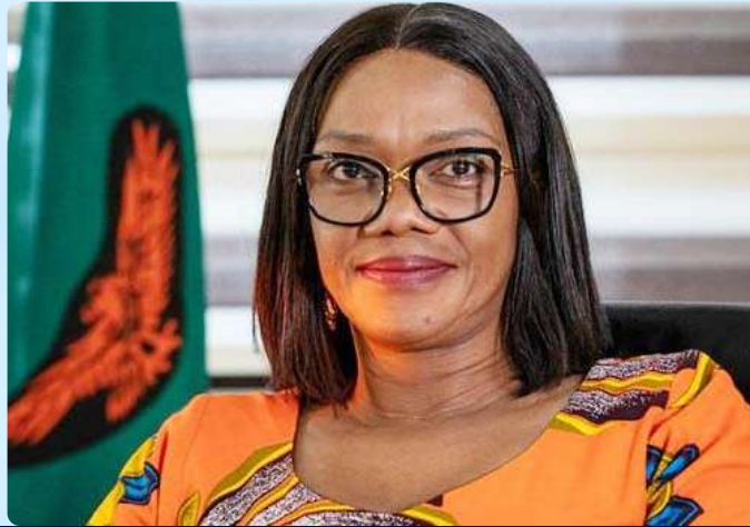
Hon. Sylvia T. Masebo